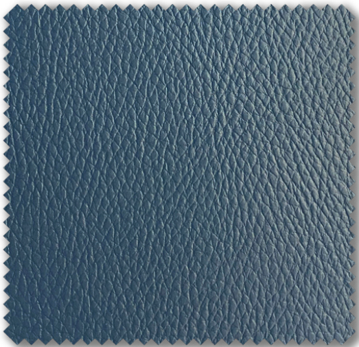
Vinyl Blue (VBL01)