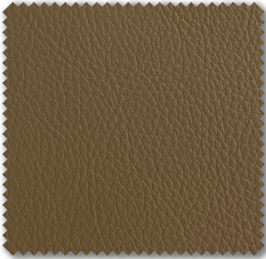
Vinyl Taupe (VTP01)