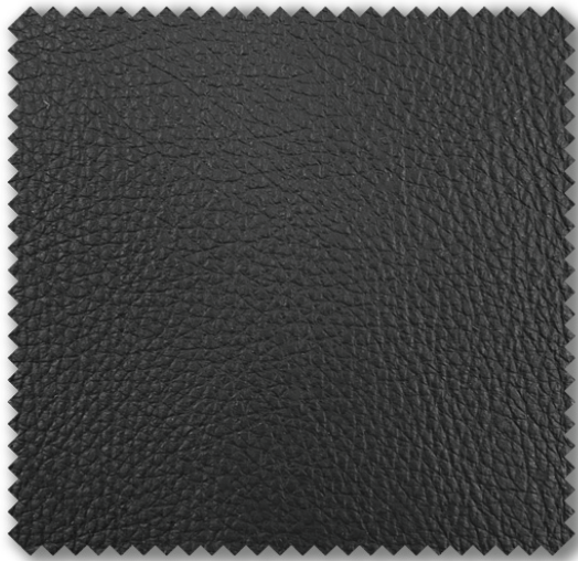
Vinyl Black (VBK01)