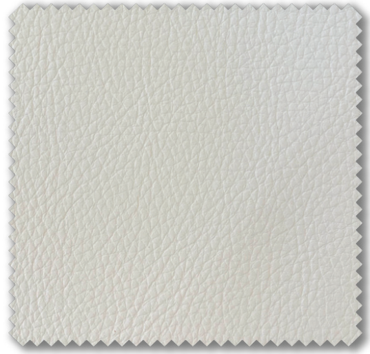
Vinyl White (VWH01)