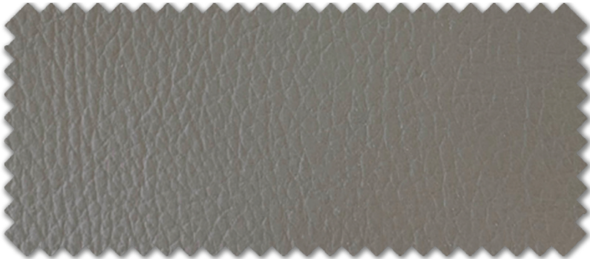
Vinyl Charcoal (VCH01)