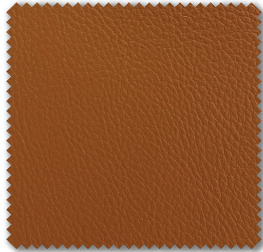
Vinyl Tan (VTN01)