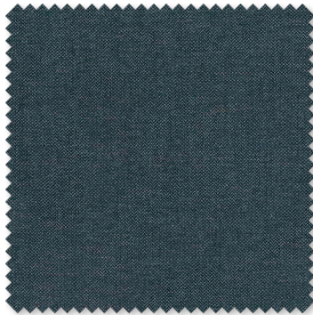
Gravity Denim (WFDE02)