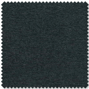
Gravity Navy (WFNA02)