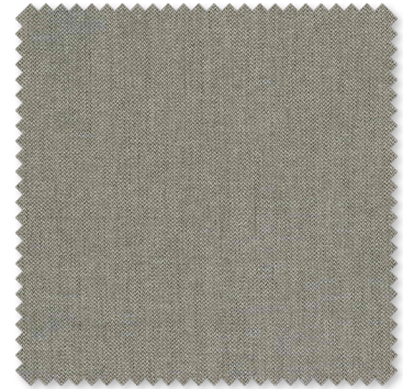
Gravity Mocha (WFMO02)