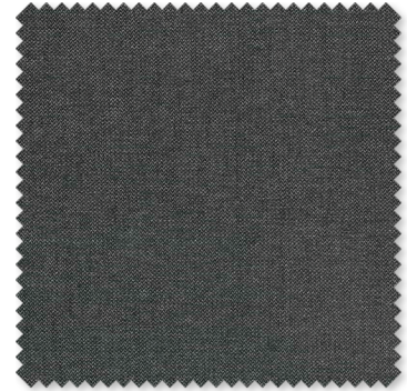
Gravity Slate (WFSL02)