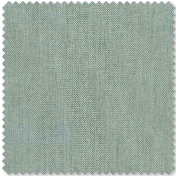
Gravity Cloud (WFCL02)