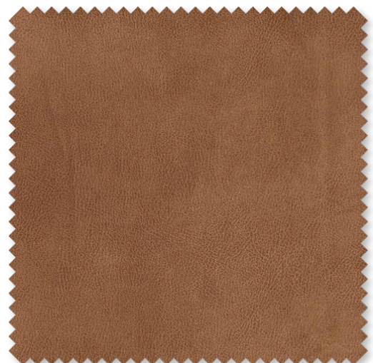
Eastwood Tan (WFTA01)