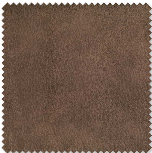
Eastwood Donkey (WFDO01)