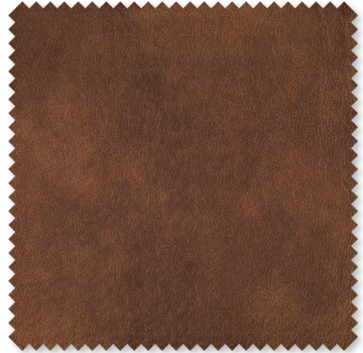
Eastwood Bison (WFBIO1)