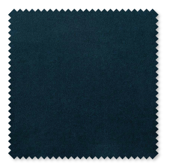
Regis Navy (WFNA04)