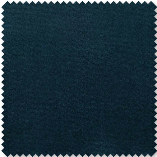
Regis Navy (WFNA04)