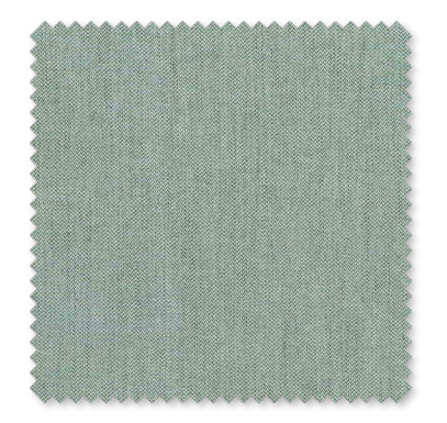
Gravity Cloud (WFCL02)