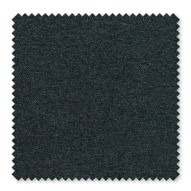
Gravity Navy (WFNA02)