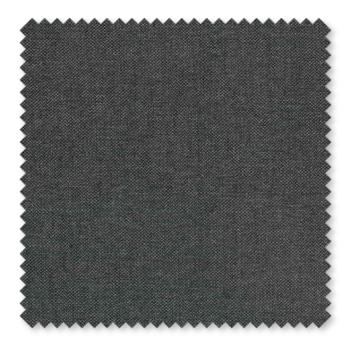
Gravity Slate (WFSL02)