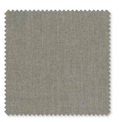
Gravity Mocha (WFMO02)