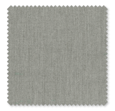
Gravity Steel (WFST02)