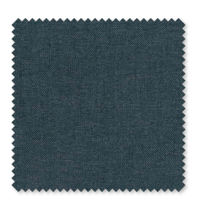
Gravity Denim (WFDE02)