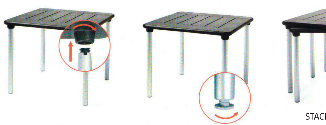
STEP 1: STEP2: